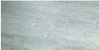
Broadway Duomo Stone TS6BRODS