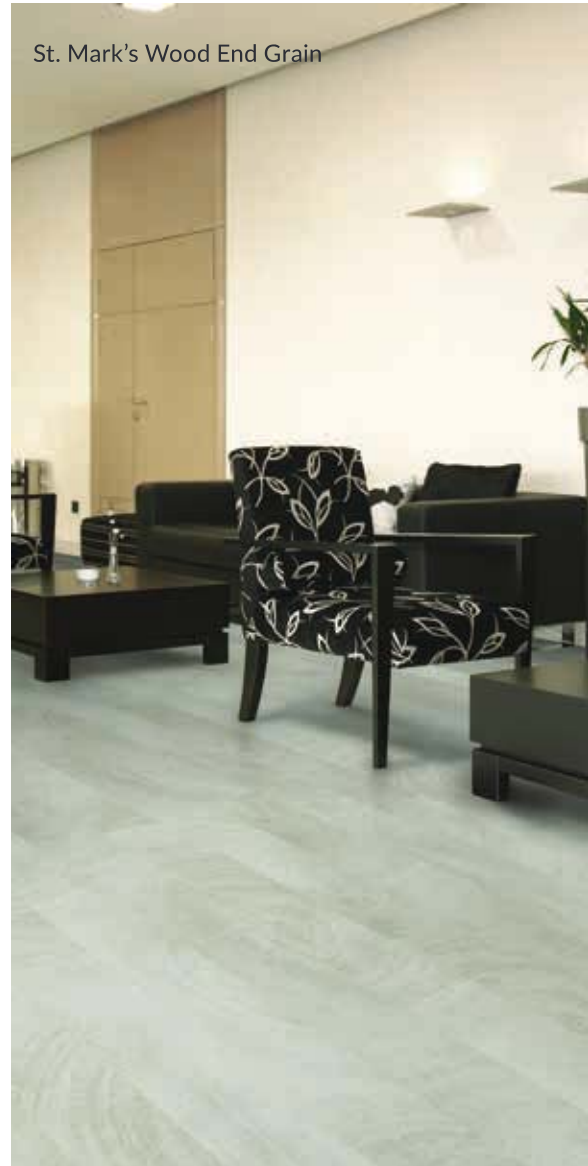
St. Mark's Wood End Grain