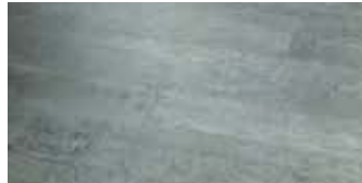
Rockefeller Duomo Stone TS6ROCDs