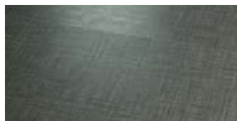
Grand Central Fabric TS18GRAFA