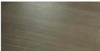
Wall Street Lineal Concrete TS18WALLC