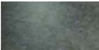
Madison Stone Concrete TS18MADSC