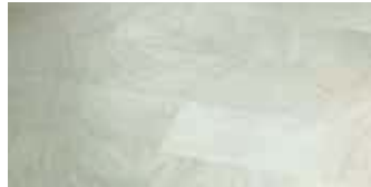
St. Mark's Wood End Grain TS6STMWE