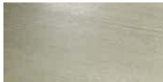
Canal Lineal Concrete TS18CANLC