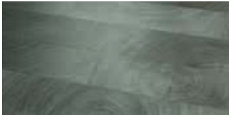
Central Park Wood End Grain TS6CENWE