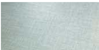
Delaney Fabric TS18DELFA