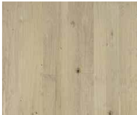
HALYARD OAK RE6HALO