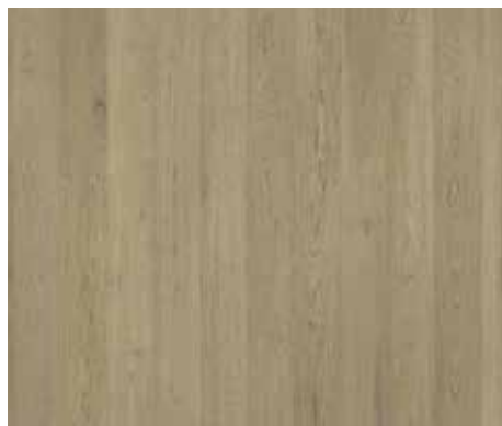
STARBOARD HICKORY RE6STAH