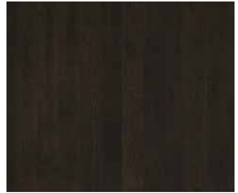
HARBOR OAK RE6HARO