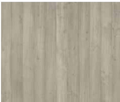
SAILMAKER MAPLE RE6SAIM