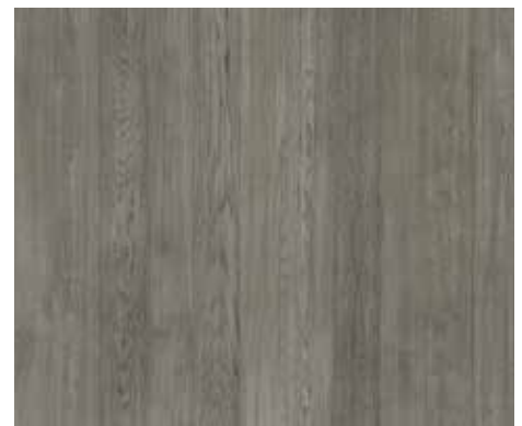
WINDWARD HICKORY RE6WINH