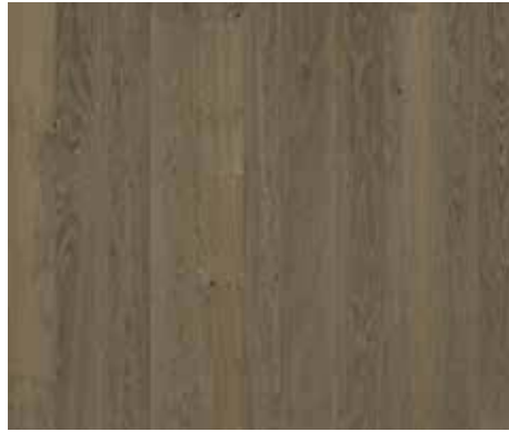
ANCHOR OAK RE6ANCO