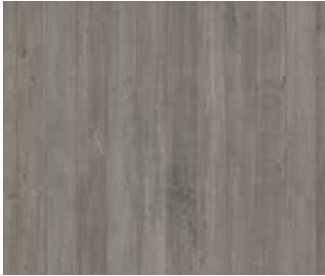
BALLAST MAPLE RE6BALM