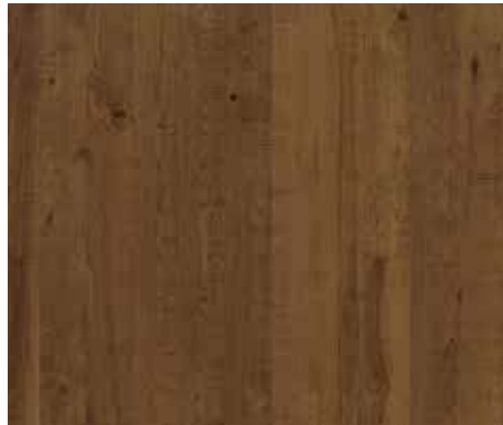
PORT HICKORY RE6PORH