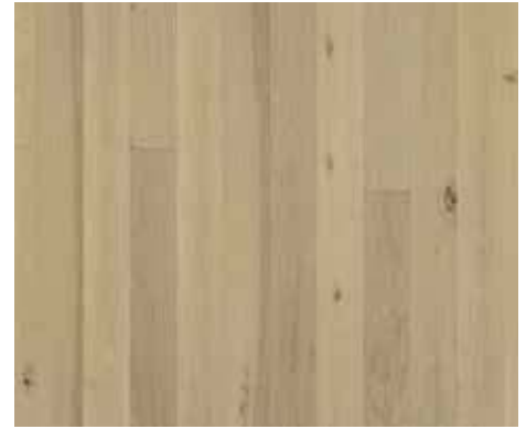
KETCH HICKORY RE6KETH