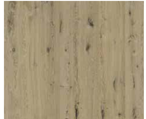
SPINNAKER OAK RE6SPIO