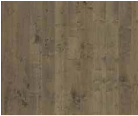
COMPASS MAPLE RE6COMM