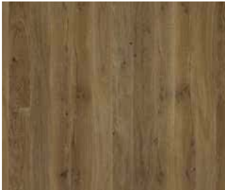
LEEWARD OAK RE6LEEO